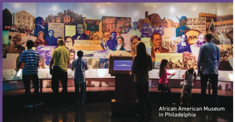
African American Museum in Philadelphia