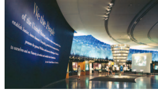
7 The Preamble wall at the entrance of The Story of We the People .