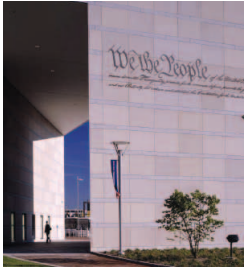
1 "We the People" façade at the National Constitution Center