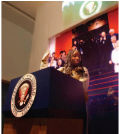
2 Students take the Presidential Oath of Office inside the Center's main exhibition, The Story of We the People .