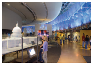
9 Visitors gaze at exact replicas of the Capitol Building, the White House, and the Supreme Court.