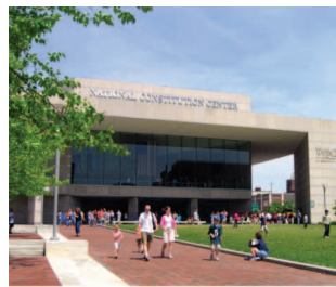
10 Outside view of the National Constitution Center.