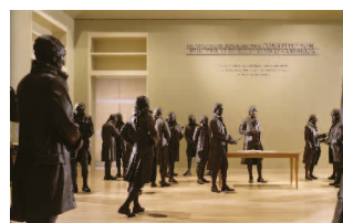
11 Signers' Hall , which contains 42 lifesize, lifelike statues of our founding fathers.