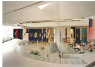
8 The Grand Hall Overlook, which features flags representing each state in order of when they joined the Union.