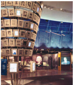
5 The American National Tree tells the stories of 100 Americans whose actions have helped write the story of the Constitution.