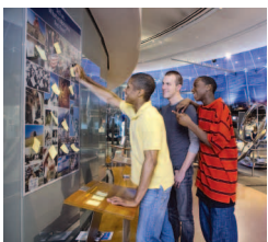
6 At "talk-back walls", visitors respond to the sort of broad questions the Founders considered and voice their opinions on Post-It notes.