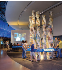
4 Students gaze at the tower of law books inside The Story of We the People .