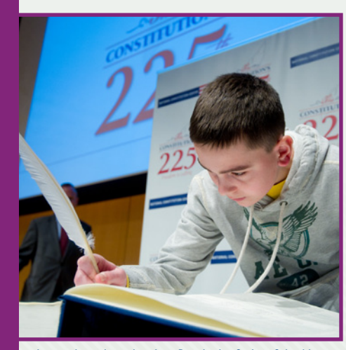
A seventh-grade student from Brandywine Springs School in Wilmington, Delaware, adds his signature to the museum's commemorative 225th-anniversary Constitution.

Despite growing consensus on the importance of civic learning, the U.S. Department of Education's 2010 benchmark assessment of students' progress in civics found only 22% of eighth graders to be at or above proficiency.